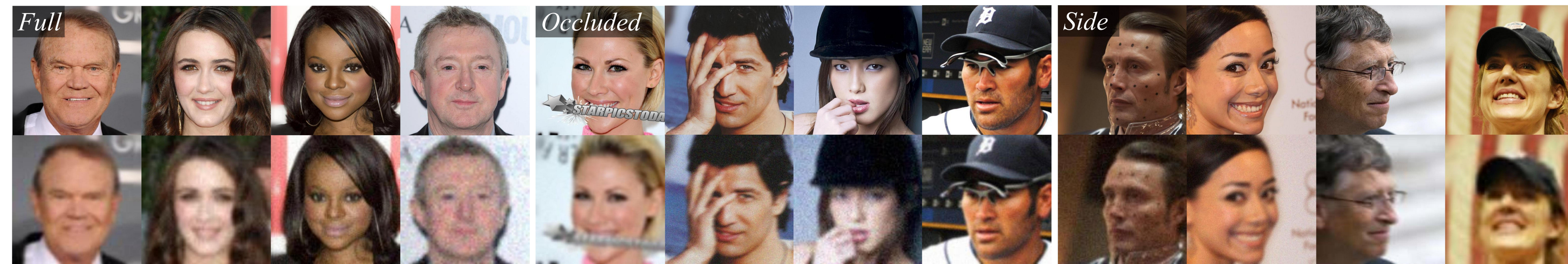
FOS-syn subset is lq-hq image pairs in which lq is synthesized from CelebA-HQ.

We further propose FOS-V to fill the gap that no video FR test set from real-world is available.