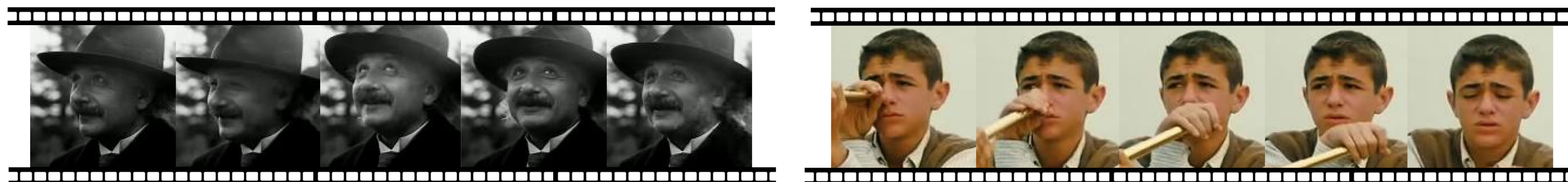
FOS-V subset includes real-word lq video clips with various face motion.

We further propose FOS-V to fill the gap that no video FR test set from real-world is available.