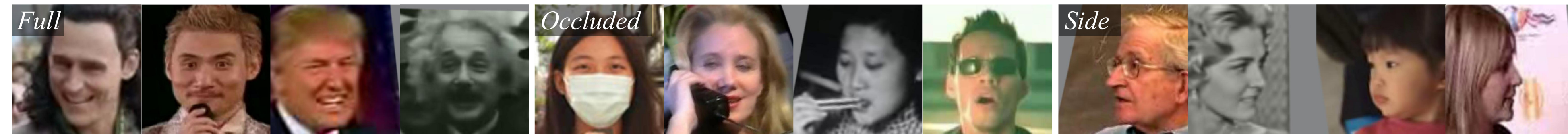
FOS-real subset includes lq face mages sampled from real-world video clips.

Thus we propose the FOS benchmark to re-think current FR methods, including image subsets of FOS-real, FOS-syn with a taxonomy of full , occluded and side faces sampled from videos.